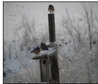
Birds sitting on birdhouse during ice storm.

who helped and continue to help clean up our beautiful town.